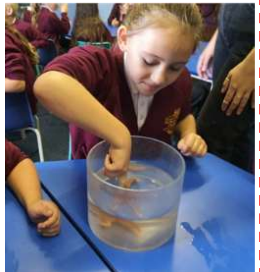
On Wednesday, Year 4 went to the Sea Life Centre to begin their Blue Abyss topic. They found out some really interesting facts about the different creatures and got to stroke a starfish!